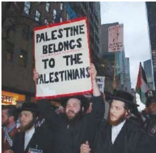
Photo: Rabbis in New York protesting against Israeli attack on Gaza.

IN THIS ISSUE: PRAYER TIME TABLE - HALAL WATCH - OPINIONS - THE WAR IN GAZA - CLASSIFIED ADVERTISING & MUCH MORE